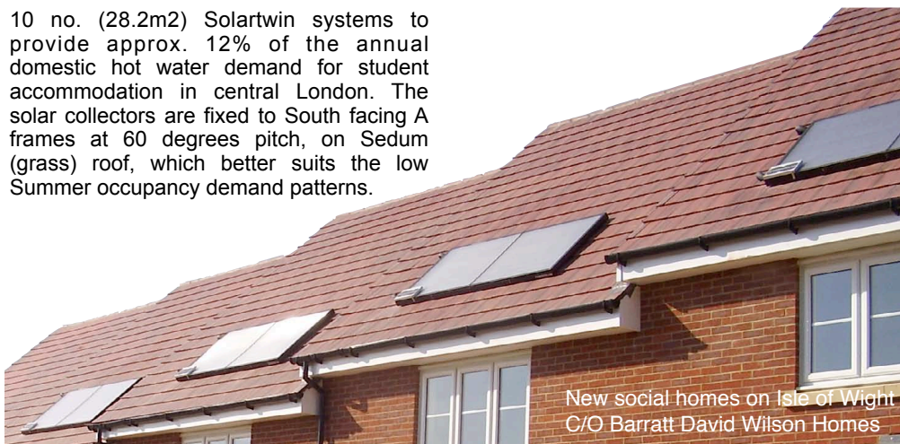
New social homes on Isle of Wight C/O Barratt David Wilson Homes

We look forward to continuing our excellent working relationship with Barratt David Wilson Homes and the client on further phases of the site in 2009.