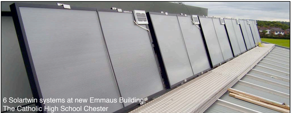
6 Solartwin systems at new Emmaus Building, The Catholic High School Chester