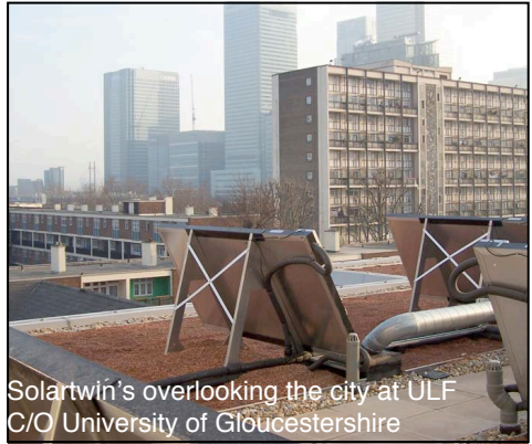
Solartwin's overlooking the city at ULF C/O University of Gloucestershire