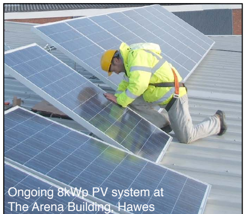
Ongoing 8kWp PV system at The Arena Building, Hawes

Anyone interested in PV should send information on their project(s) including drawings if available to info@solartwin.com